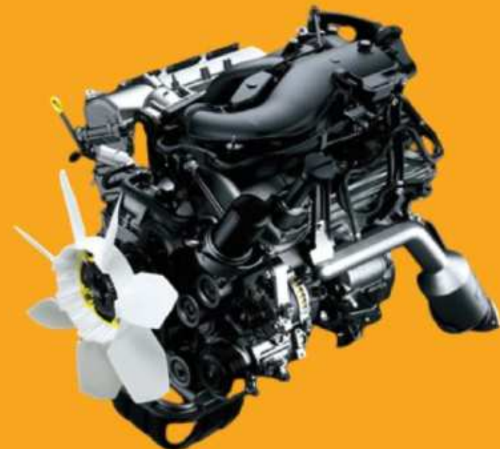
4.0L, V6, DUAL VVT-I ENGINE