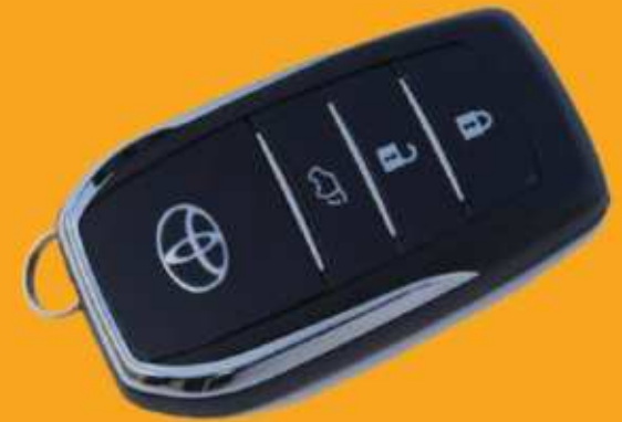
SMART ENTRY WITH PUSH BUTTON START

WINDOW DEFOGGER WIPER FR INTERMITTENT TIME ADJ. WIPER RR WITH INTERMITTENT 12V AIR COMPRESSOR ANTI-THEFT SYSTEM AUTO LIGHT CONTROL FOLLOW ME HOME BACK CAMERA PANORAMIC VIEW MONITOR (PVM) CARGO MAT COMBINATION METERS OPTITRON TYPE + 4.2" TFT SCREEN DAYTIME RUNNING LIGHTS WITH-TYPE2 FLOOR MAT FLOOR ILLUMINATION FOG LAMPS FR/RRWITH- LED / WITH HEAD LAMP LED BI-BEAM + AUTO LEVELLING HEADLAMP LEVELING AUTO REAR PARKING SENSORS FRONT2+REAR4 ROOF RAILS SPARE WHEEL FLOOR MOUNTED STEERING WHEELLEATHER + WOODGRAIN W/ CONTROL SWITCHES+PADDLE SHIFT TYRE PRESSURE MONITORING SYSTEM