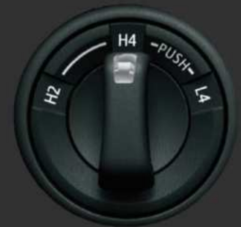
PART TIME 4WD